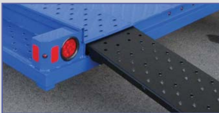
Slide Out Ramps