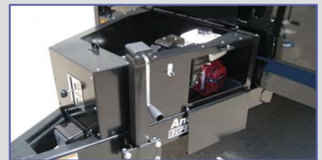
Gasoline Powered Hoist

The tough, durable, feature-rich design, high-quality materials, attention to detail and craftsmanship we put into every trailer built, is what makes it an Andersen SUPER DUTY trailer.