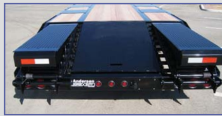
Pop Up Beavertail