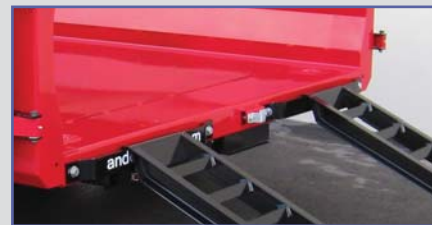
Dump Trailer Ramps