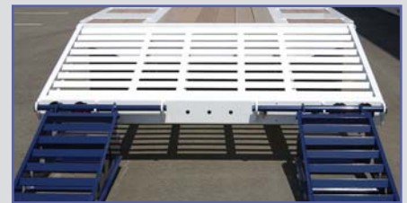
Self Cleaning Beavertail