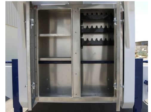
GOOSENECK TOOL BOX