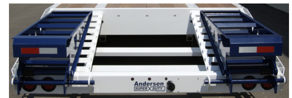
BUCKET SLOT BEAVERTAIL