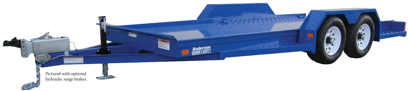
Pictured with optional hydraulic surge brakes.