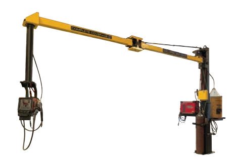
The WELDPRO 360LRW-18P Mig Welding Arms reduce or eliminate non-arc time welding-related tasks, shop floor clutter, and employee safety issues. This arm provides complete coverage anywhere with-in a 56' diameter semi-circular welding zone. The welding arm's main pivot assembly mounts to your existing building column, freestanding column or the optional mobile base and column assembly.

There are two boom arms, a primary and secondary. The primary arm is connected to the main pivot assembly and has a maximum of 192° of semi-circular rotation on a horizontal plane.